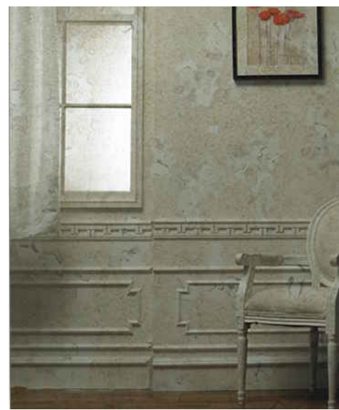
MIRALITE VERSAILLES clear