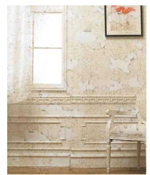
MIRALITE ANTIQUE bronze